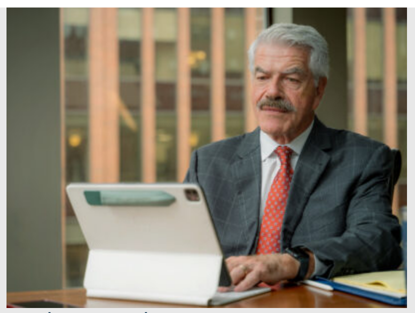
Business Today Names NHD Attorneys as "Top 10 Most Influential"